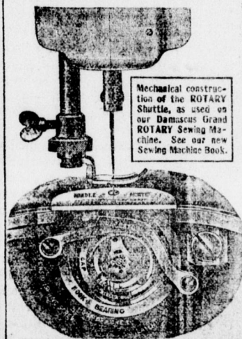
Mechanical con- struction of the ROTARY Shuttle, as used on our Damascus Grand ROTARY Sewing Ma- chine. See our new Sewing Machine Book.

Among its many benefits to the operator are: Highest speed; noiseless; easiest to operate; double thread lock stitch; no twisting of thread; bobbin case easily removable; tension automati- cally self-adjusting for difference in length of stitch and thickness of goods; feed absolutely positive and most reliable known; tension release automatic; face plate removable without screw driver; take up is positive and automa- tic and handles properly any kind or size of thread, silk, cotton or linen; round needle bar saves oil and wear; stitch regulator marks 6 to 32 stitches to the inch; finest finish, nicked, enameled and ornamented; high arm with ample room for the most bulky work; and many other exclusive features, making it the most desirable and up to date machine, and the only one to buy.