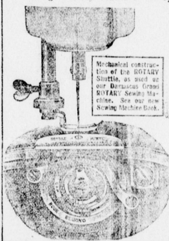
Mechanical construction of the ROTARY Shuttle, as used in our Damascus Grand ROTARY Sewing Ma- chine. See our new Sewing Machine Book.

Among its many benefits to the operator are: Highest speed; noiseless; easiest to operate; double thread lock stitch; no twisting of thread; bobbin case easily removable; tension automati- cally self-adjusting for difference in length of stitch and thickness of goods; feed absolutely positive and most reliable known; tension release automatic; face plate removable without screw driver; take up is positive and auto- matic and handles properly any kind or size of thread, silk, cotton or linen; round needle bar saves oil and wear; stitch regulator marks 6 to 32 stitches to the inch; finest finish, nicked, enameled and ornamented; high arm with ample room for the most bulky work; and many other exclusive features, making it the most desirable and up to date machine, and the only one to buy.