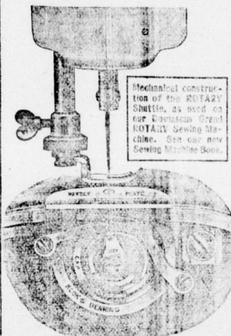
Mechanical construc- tion of the ROTARY Shuttle, as used on our Damascus Grand ROTARY Sewing Ma- chine. See our new Sewing Machine Book.

Among its many benefits to the operator are: Highest speed; noiseless; easiest to operate; double thread lock stitch; no twisting of thread; bobbin case easily removable; tension automati- cally self-adjusting for difference in length of stitch and thickness of goods; feed absolutely positive and most reliable known; tension release automatic; face plate removable without screw driver; take up is positive and auto- matic and handles properly any kind or size of thread, silk, cotton or linen; round needle bar saves oil and wear; stitch regulator marks 6 to 32 stitches to the inch; finest finish, nicked, enameled and ornamented; high arm with ample room for the most bulky work; and many other exclusive features, making it the most desirable and up to date machine, and the only one to buy.