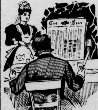
"The newspaper goes right into its reader's house and sits down with him."

That's the time to tell him about your business—clearly, plainly, convincingly—as one man talks to another.