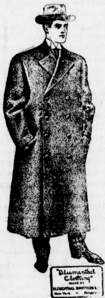
"Diamond Clothing" MADE BY THE DIAMOND CLOTHING CO. NEW YORK

Please come quick and your share of the bargains