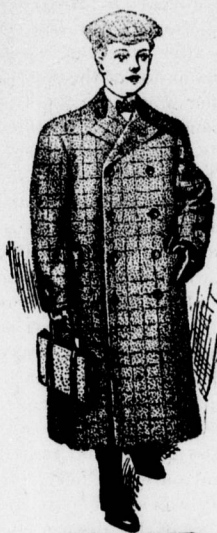
"Blumenthal Clothing" MADE BY BLUMENTHAL BROTHERS & CO. New York - Philadelphia