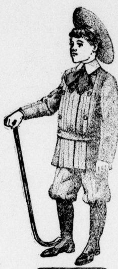
"Blumenthal Clothing" MADE BY BLUMENTHAL BROTHERS & CO. New York - Philadelphia

Just returned from New York and Philadelphia purchased a big stock of Clothing, Boots and all kinds of lumbermans boots and shoes. He paid for everything, cash; he bought these goods at the lowest price so there's a chance for everybody that wants to buy good clothing everything will be low in price. Please come at once sale goes on now. You can save 35 to 40 per cent on the dollar. Everything new goes. Everybody is invited to come and see me. You can get boys' shoes from 45c to 95c, and suits from 1.00 up. Mens suits from 3.50 up; and a big line of Ladies' Watches, Mens Watches, everything up to date and warranted. Ladies' shoes to fit foot and suit the purse.