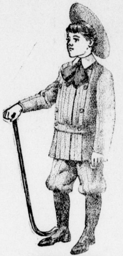
"Blumenthal Clothing" MADE BY BLUMENTHAL BROTHERS & CO. New York - Philadelphia

Just returned from New York and Philadelphia: purchased a big stock of Clothing, Boots and all kinds of lumbermans boots and shoes. He paid for everything, cash; he bought those goods at the lowest price so there's a chance for everybody that wants to buy good clothing everything will be low in price. Pleas come at once sale goes on now. You can save 35 to 40 per cent on the dollar. Everything new goods everybody is invited to come and see me. You can get boys' shoes from 45c to 95c. and suits from 1.00 up. Mens suits from 3.50 up; and a big line of Ladies' Watches, Mens' Watches everything up to date and warranted. Ladies' shoes to fit foot and suit the purse.