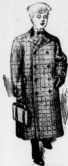
"Blumenthal Clothing" MADE BY BLUMENTHAL BROTHERS & CO. New York - Philadelphia