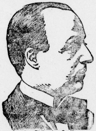
Senator Philander C. Knox.

Without any authority whatever some of the Lincoln Party adherents have been circulating reports that members of President Roosevelt's cabinet