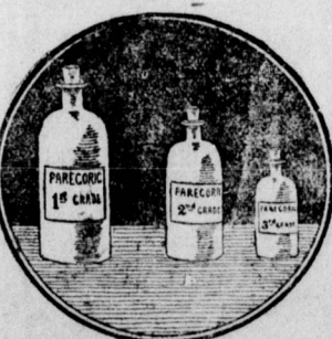
"The paregoric they get in one store is better than that they get in another."