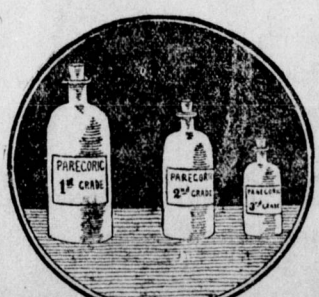
"The paragon they get in one store is better than that they get in another."