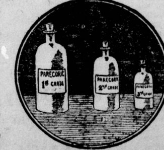
"The paregoric they get in one store is better than that they get in another."