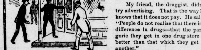
"There were two other drug stores nearby. The people round about were acquainted with them."

He said that his store had been an exceptionally good one; that the location was very fair, and that the stock was above reproach, but there were two other drug stores nearby which had been there for some time before he came. The people round about were acquainted with them, and to some they were just a little bit more conveniently situated than the new store.