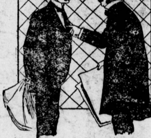
"I would have them understand just what I was trying to do."

When you advertise something of special interest in the papers, fill the window with it and have it prominently displayed in the store. Have some neat tickets painted and hung up above or near the goods.