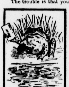
"When you've done my way, drop in."

If the ad. is an honest ad. it will always pay.