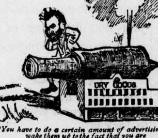
"You have to do a certain amount of advertising to wake them up to the fact that you are in business at all."