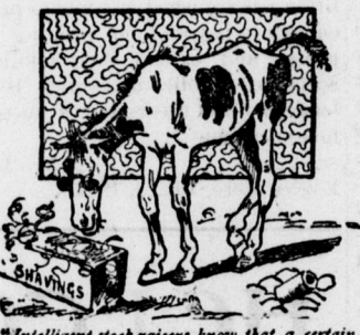
"Intelligent stock raisers know that a certain amount of feed is necessary to keep an animal alive."

Intelligent stock raisers know that a certain amount of feed is necessary to keep an animal alive. They might feed that amount as long as it lived, and it would never gain a pound.