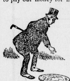
"You are there when others are not."