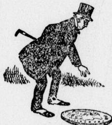
"You are there when others are not."