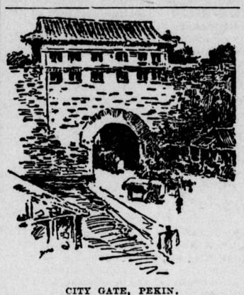
CITY GATE, PEKIN.

movement against Christians, foreigners and native reformers was undoubtedly a consolation to the Manchu mandarins and the Empress. Indeed, last January they were referred to in tones of high approbation by the latter august personage, and, in consequence, it is impossible to withhold some measure of sympathy for the "Boxers" in the position in which they find themselves.