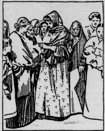
SANTA TERESA OF MEXICO.

The central figure in this picturesque and interesting group is one of the most remarkable women in the world. She is nothing more or less than a living "saint," who is not only worshipped