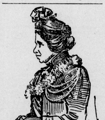
EX-QUEEN LILIUOKALANI OF HAWAII.

Liliuokalani Returns to Hawaii. Her former Majesty Liliuokalani, of the Hawaiian Islands, and party recently left Washington for San Francisco. From there they go to Honolulu, where the ex-queen will remain till December, when she will return to the United States to conclude her business affairs with this country.