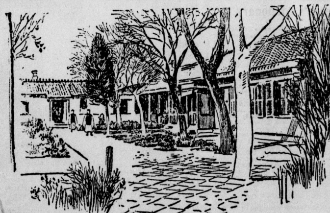
INTERIOR OF UNITED STATES LEGATION AT PEKIN. (This is the courtyard of Minister Conger's house in the Chinese capital.)

There must have been shrewd leaders among the insurgents. They took special pains, for the most part, to avoid open collision with European