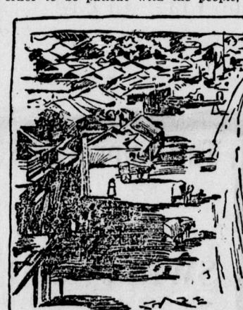
CENTRAL BUSINESS STREET IN PEKIN.

exception, were not touched. It was their followers that felt the blow. Missionaries were left in safety, but native Christians were butchered. The movement grew, and the crowd became more open in its manifestations.