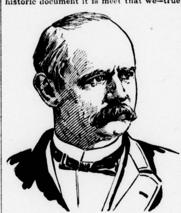
ADLAI E. STEVENSON.

lows: More than 100 years ago the Continental congress of America adopted a declaration which had been drafted by the founder of the Democratic party, and the joyous tones of the old Liberty bell which greeted the act announced to a waiting world that a nation had been born. With hearts unchilled by the selfish sentiments of cold commercialism you have responded patriotically to each sentiment contained in Democracy's first platform as it was read to you at the opening of this convention, and in view of the radical departure which the party in power has made from the principles set forth in that historic document it is meet that we-true