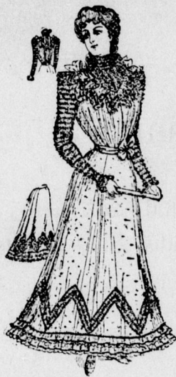
YOKE WAIST AND GORED SKIRT.

NEW YORK CITY (Special). —White point d'esprit is here stylishly trimmed with narrow satin ribbon, lace edging and insertion, ribbon of suitable width forming the belt and