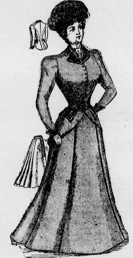
WOMAN'S WALKING TOILET.

A Useful Ulster. The useful ulster or long coat is again in the front rank of fashion's parade. The protection and comfort it affords are too well known to be it affords are too well known to be long lost sight of, and for school girls there is no top coat that can well take its place. Beaver-colored cheviot cloaking is the material here represented, the finish being strictly in tailor style, with double rows of machine stitching. Clear crystal buttons are used in closing the double-breasted fronts, which are loose fitting, but are used in closing the double-breasted fronts, which are loose fitting, but under arm and side back gores with a curving centre seam render a close adjustment in sides and back. Stylish coat laps are formed in centre and backward turning plaits at the end of the side back seams just below the the side back seams just below the waist line. The fronts are under-faced and reversed at the top to form lapels. The neck is finished with a high storm collar, a pointed strap buttoned across the front holding it close to the neck when raised for protection in inclement weather. Pockets