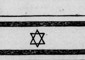
THE FLAG OF THE HEBREWS.

One of the results of the Zionist Congress at Basle is the reappearance of the Hebrew flag in New York City. At the meeting-place of the delegates a flag was hoisted which had two blue stripes on a white field, and between these the six-pointed star, or sign of David. It was explained at that time