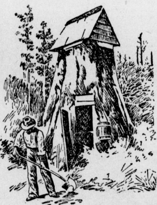
ONE OF THE STRANGEST OF DWELLINGS.

The Quickest Home in the World. The accompanying picture is a reproduction from the Australian of a gum