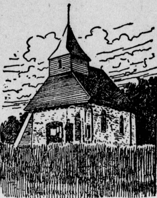
LULLINGTON CHURCH, WHICH CLAIMS TO BE THE SMALLEST IN ENGLAND.

Where is the smallest church in America? It would be interesting to know. The smallest church in England has been discovered at Lullington, in Sussex. The village itself is on so small a scale that the miniature church, some sixteen feet square, is quite large enough to supply its needs. Built in medieval times upon a slight eminence within a short distance of Alfriston, famous for its sixteenth century hostelry, the church is reached by a path which passes through charming scenery. The present structure stands upon the site of the chancel of the building destroyed during the Cromwellian struggles, and at the same time the church records disappeared, so that even the name of the patron saint is not now known. Some idea of the diminutive appearance of the building, which accommodates only about thirty worshippers, can be gathered from a glance at our illustration. Inside the small sanctuary the large pulpit completely dwarfs the scanty sitting accommodation. The belfry is more for ornament than use, and the birds are allowed to retain undisputed possession.