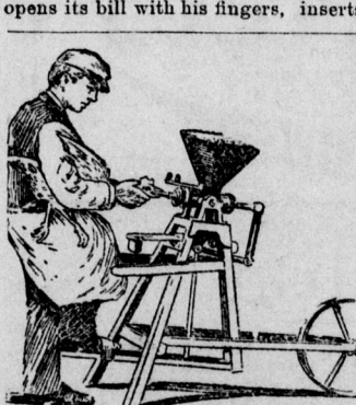
THE STUFFER AT WORK

Opening each cage door in succession, the boy takes out a fowl and holds it under his arm. Deftly he opens its bill with his fingers, inserts