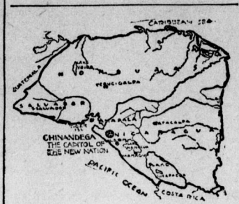
MAP OF THE NEW UNITED STATES.

dissatisfaction in this new nation. The Presidents of the States become Gov-ernors. It has been agreed that none of them shall become a candidate for