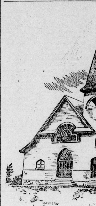
CHURCH OF THE SACRED HEART.

how natural to infer that he would not disdain to dwell in a temple erected by His servants, and that temple raised by David's son remains for ages the centre of the nation's religious life, although there were synagogues in all the cities of Palestine, to which the people resorted for prayer, and the hearing of the word of God, yet it was only in the temple of Jerusalem that sacrifice was offered. During the paschal season it was estimated that between two and three millions of people came in from the surrounding country to perform their religious duties. You see what sacrifice the people made in those days for the preservation of their faith and what a heavy yoke was laid upon them. But, at one of their great celebrations in the temple a youth of twelve years stood for the first time in their midst whose divine mission it was to lessen this heavy burden, to lighten this galling yoke. By His will and enactment that one temple of sacrifice at Jerusalem would be replaced by millions of temples erected in the