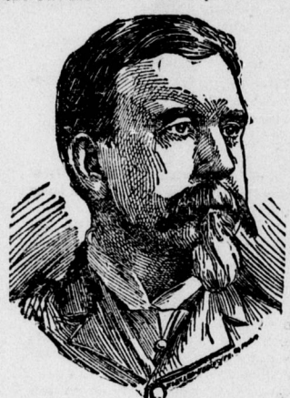
GENERAL D. H. HASTINGS.

ot Visitors, impressive. Surrounded by the lawmaking and judicial branches of the state government, prominent men in all walks of life and citizens of all classes, he took the oath of office and delivered an address which is characteristic in its forceful, succinct and eloquent presentation of those matters which occured to the new governor to be proper to discuss at the out set of his administration.