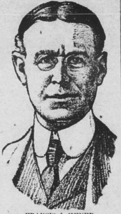
FRANCIS J. HENEY.