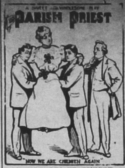
AT THE LOOMIS TONIGHT.

Be willing to do your best to-day. There is no time like the present.