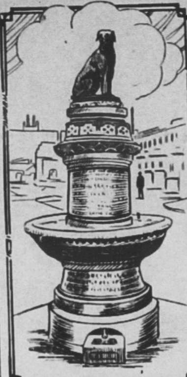
Fountain Erected by British Anti-Vivisectionists.

"To the memory of the brown terrier done to death in the laboratory of the University college after having en-