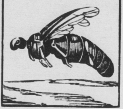
The Strange Airship.

Remarkable Craft Which Represents a Flying Insect. Paris—it has remained for three members of the Aero club, of Belgium, to evolve an aerostat which is an almost exact representation of a flying insect.