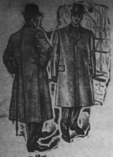
Crew Clothes Suits, Overalls & Coats