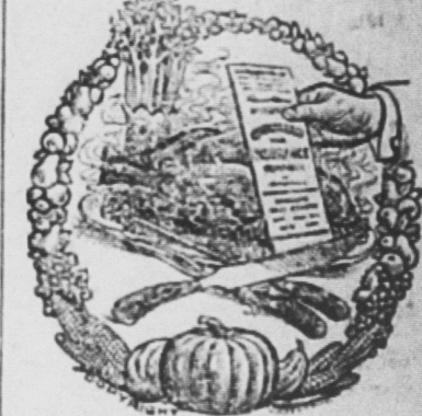
Among Thanksgiving Good Things

Has removed his offices from the Lockhart building also Vest Pocht and Deek Receipt to No. 217 South Elmer Ave.