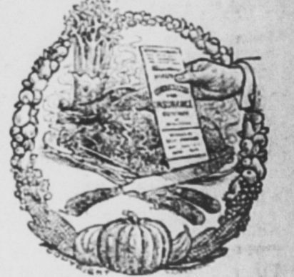
Among Thanksgiving Good Things

This is an excellent time of year to have a heating system installed and ready for the hard winter which the weather man says is coming. We would be pleased to offer suggestions or give estimates on steam, hot water or hot air systems. We sell the satisfactory "Winchester steam and hot water heaters, the American Radiator Co's radiators and boilers and the justly famous "Cheerful Home" furnace, making a fine line for you to choose from.