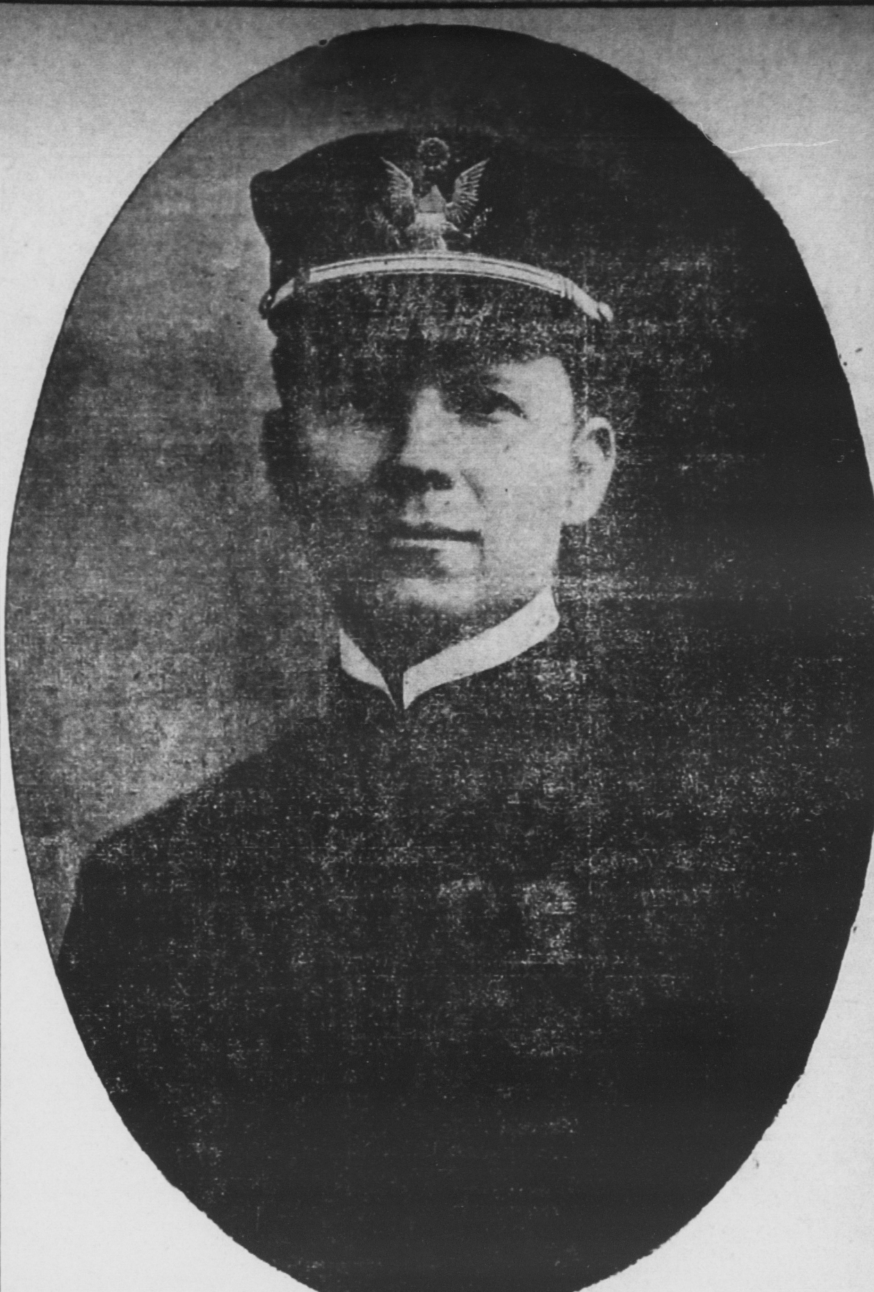
Arthur Pryor and His Band of Fifty at Loomis Opera House, Thursday Afternoon, Oct. 25.