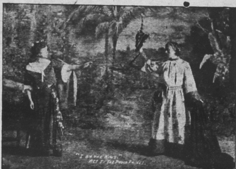
Nixon & Zimmerman's Big Production of "The Proud Prince," Loomis Opera House, Monday Night, October 22.