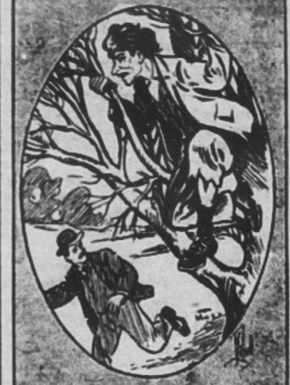
PERCHED LIKE A WILD TURKEY IN A TREE TOP.

Dracula has been wandering near the pumping station, which is used to supply a portion of Brooklyn.