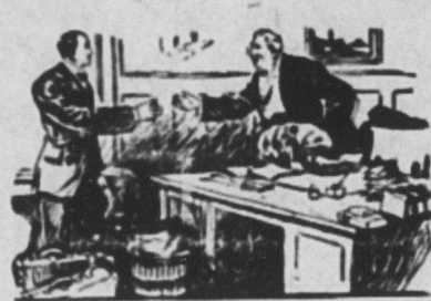
"WITH A RADIANT, WELCOMING SMILE."

UT again?" said the leather goods salesman, as the coffee and spice forrunner came down the aisle toward him. "Out again, in again, on again, off again. Finsberg said the coffee and spice man, dropping his two sample cases in the space between the reversed seats. "Off again and don't you think of a raise again."