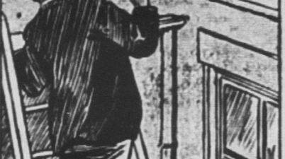
THE MANIC DEFIED THEM TO TAKE HIM DOWN.