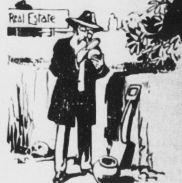
IN THE GROUND