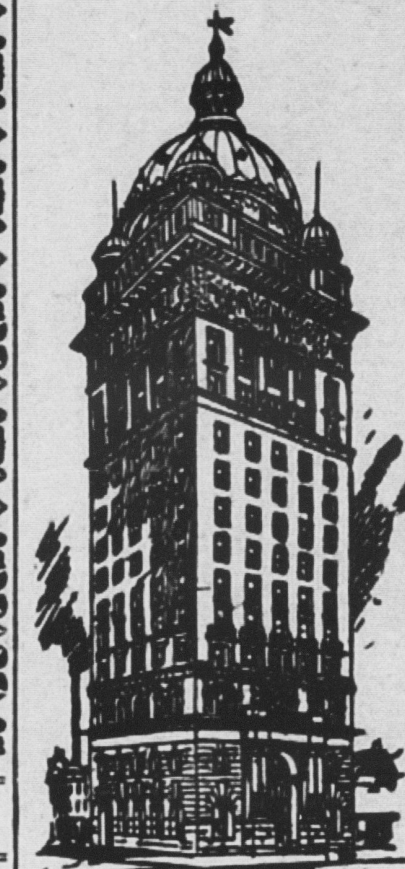
SAN FRANCISCO CALL BUILDING, San Francisco's Finest Skyscraper.

Here is without question the biggest and best offer ever made to newspapers readers in this section of the country, or for that matter that has ever been made by any newspaper, big or little, in Northern Pennsylvania. San Francisco, a city of 400,000 inhabitants has been almost totally destroyed by earthquake and fire; hundred have been killed; thousands have been rendered homeless; millions of dollars worth of property has been destroyed, and all in all the most terrible calamity that has ever visited the new world is now a matter of history.