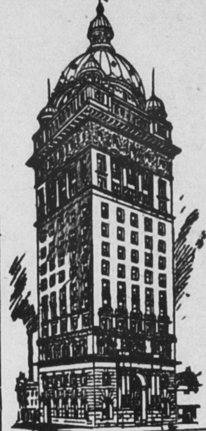
SAN FRANCISCO CALL BUILDING. San Francisco's Finest Skyscraper.

Mail Orders should be addressed to "Book Department," Valley Record, Sayre, Bradford County, Pa.