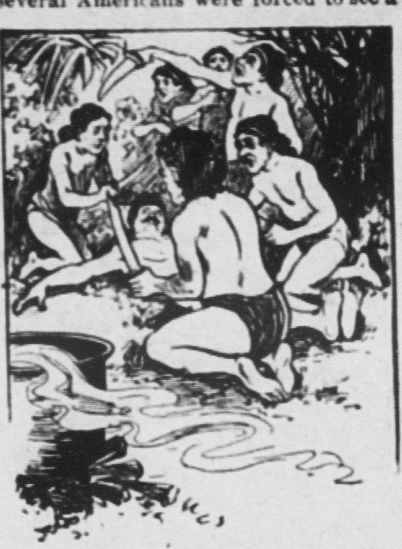
THE INDIANS PROCEEDED TO DISMEMBER THE CORPSE.