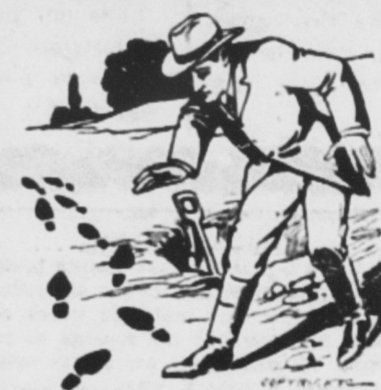
Others Before You

have made independent fortunes by —wisely chosen investments in real estate —which can't run away. Why not you? —It doesn't require millions to get hold of —a little land, yet millions may accrue as —the years roll around. We have some —special inducements to offer buyers of —real estate we'd like to lay before you. —May we have your name and address?