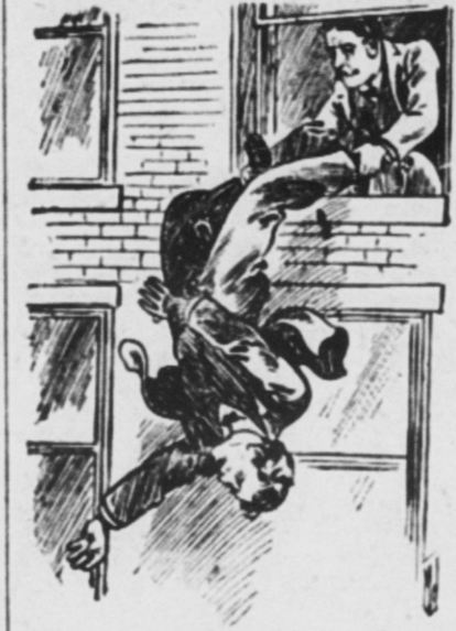
HE GRASPED THE ANKLES OF THE FALLING MAN.

They saw the officer, and, running to his assistance dragged Lally back into the room. The man was almost unconscious, the blood having gone to his head during the long time that he hung suspended between life and