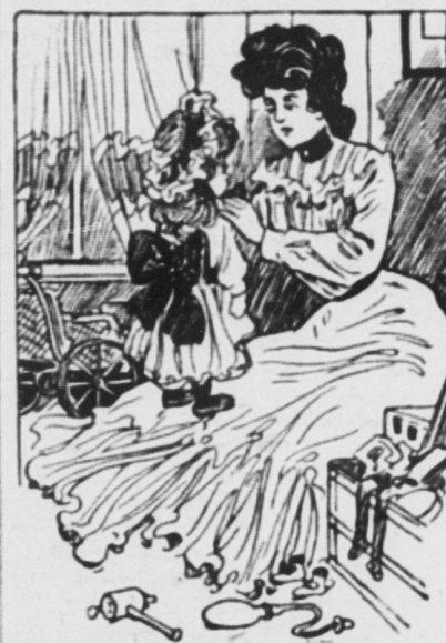
SHE SAT ON THE FLOOR AND PLAYED WITH DOLLS