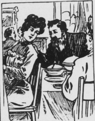
HE ASKED THE WOMAN IF HE MIGHT SPEAK WITH HER.

Shortly after the rejection of his suit Kinney left Janesville. Occasionally reports of his successes reached home and found their way to Miss Cadwell. Whether she resented over the coldness with which she had received Kinney's advances is her secret. In a few years, rejecting all other suitors, she decided to devote her life to school-teaching, and she, too, left Janesville. With the death of her family and friends the last ties that bound her to the village where she was born were severed years ago. When Kinney had seen enough of the world to decide, as he thought,