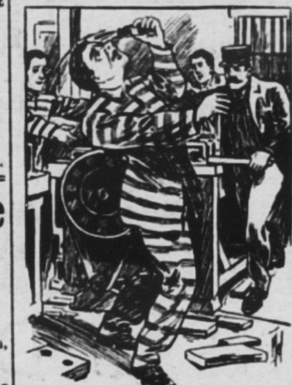
HE DASHED A SIGHT-DESTROYING DRUG IN HIS EYES.

Stranded travelers and consumptives roaming the southwest, only to die by slow stages, were special objects of