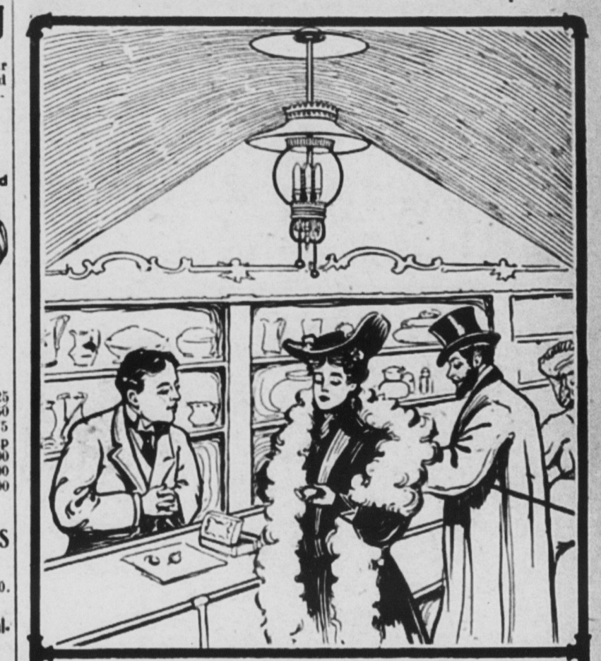
What is more attractive than a well-lighted store? It draws trade. It holds trade. It shows prosperity. It is a winner. The Humphrey Arc does it. Try it.

The Gas Light Company of Waverly, 340 Broad Street. Both Phones. Waverly, N. Y.