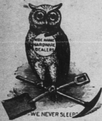
WE NEVER SLEEP