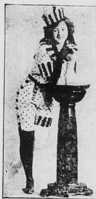
The Scarecrow in "The Wizard of Oz."