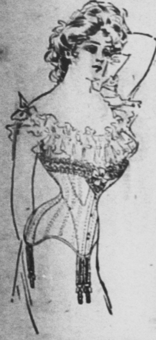
AMERICAN BEAUTY Style 733 Kalamazoo Corset Co. Sole Makers to you.