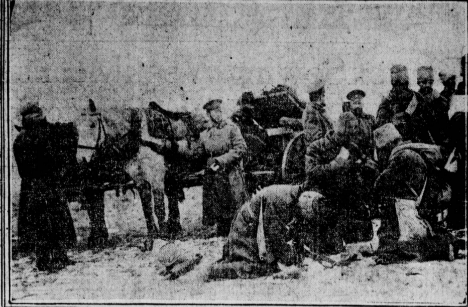
YOU would scarcely want to change places with the brave fellows at the front during this cruel European conflict after viewing this picture, showing Russian troops being supplied with ammunition, while the thermometer hovers about the Zero mark.